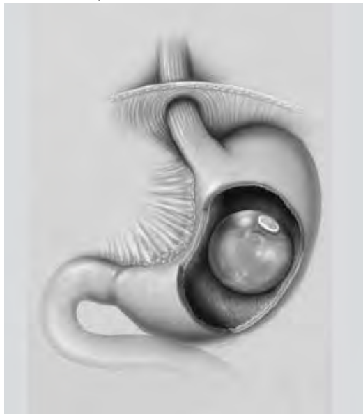
Figure 2. Saline-filled ORBERA™ in the stomach

ORBERA™ is placed in the stomach and filled with saline, causing it to expand into a spherical shape (Figure 2). The filled balloon is designed to occupy space and move freely within the stomach. The expandable design of ORBERA™ permits a fill volume range of 400cc (minimum) to a maximum of 700cc (refer to section 11.2 for filling guidelines). Once filled, the ORBERA™ volume is not adjustable. A self-sealing valve permits detachment from external catheters (see Section 10 Instructions for Use).