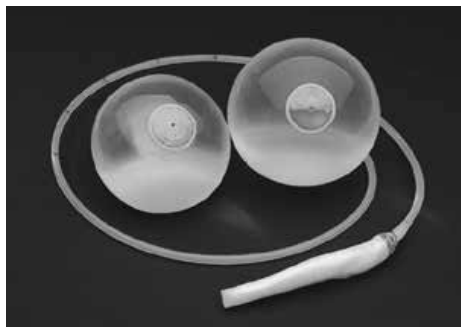
Figure 1. ORBERA™ filled to 400 cc and 700 cc with unfilled system in the foreground

ORBERA™ (Figure 1) is designed to assist weight loss by partially filling the stomach.